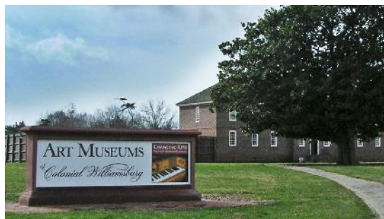
Museum sign welcomes visitors to the “Changing Keys” exhibit