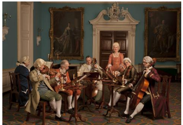
The Governor's Musick, Colonial Williamsburg's resident performing ensemble shown in the Governor's Palace

Early registration fees (before April 30) are: Students, $128; Members, $189; and Non-members, $259. Late registration (after April 30) are: Students, $158; Members, $219; and Non-members, $289. Registration will include daily admission to the museum, all meeting sessions and concerts, and the banquet. Optional historic-area tickets for attendees and additional banquet tickets can be ordered on the registration form. Partial registrations are not possible. A registration form is attached with this newsletter and is available at http://www.historicalkeyboardsociety.org/ .