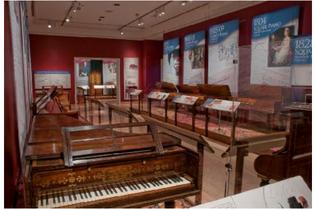
New exhibit entitled "Changing Keys: Keyboard Instruments for America 1700–1830"