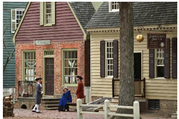
Duke of Gloucester Street, Williamsburg

From Norfolk Airport (ORF) Check their website's "Ground Transportation" section for a list of shuttle and taxi options. You can also use the Norfolk Airport Express shuttle service. Cost is about $118 per person, rates may vary. Requires 48 hours advance notice by calling 1-866-823-4626.