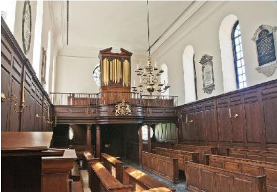
Wren Chapel at the College of William and Mary