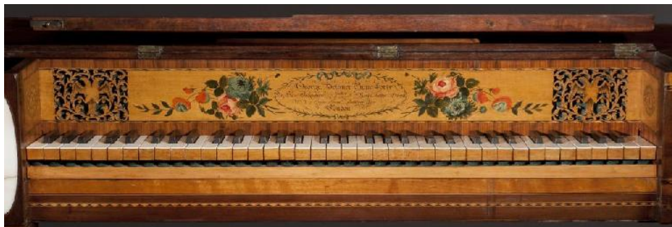
Square piano by Georg W. Dettmer (London, ca. 1810)