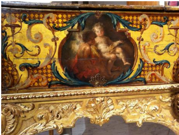
Double-manual harpsichord by Blanchet (Paris, 1765) at the Hamamatsu Museum of Musical Instruments

There is a great deal of Early Music activity in Japan. Between Yokohama and Tokyo, I could have attended at least two major Early Music performances per week—concerts in large halls with elegant publicity and often sold out. During my visit, there was a brilliant performance of J. S. Bach's The Art of Fugue involving ten instrumentalists, a harpsichord festival and a weekend Early Music festival of five concerts. There are numerous other opportunities to hear good historically informed performances of music written before 1800, particularly Baroque music.