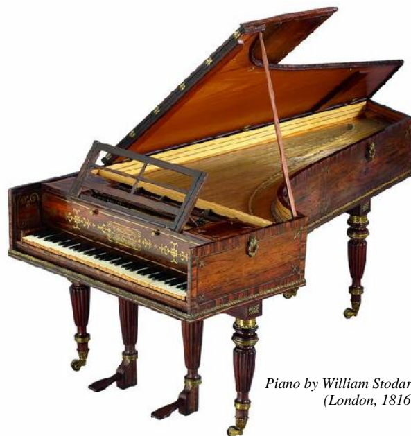
Piano by William Stodart (London, 1816)