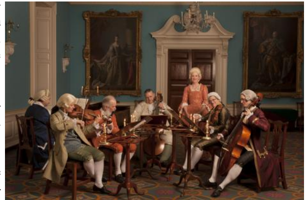
Colonial Williamsburg musicians

Sessions will take place in the Museums of Williamsburg, where the exhibit “Changing Keys: Keyboard Instruments for America 1700-1830” will have just opened; the Williamsburg Lodge and Conference