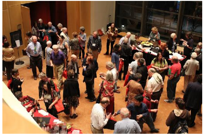
Reception after the opening concert