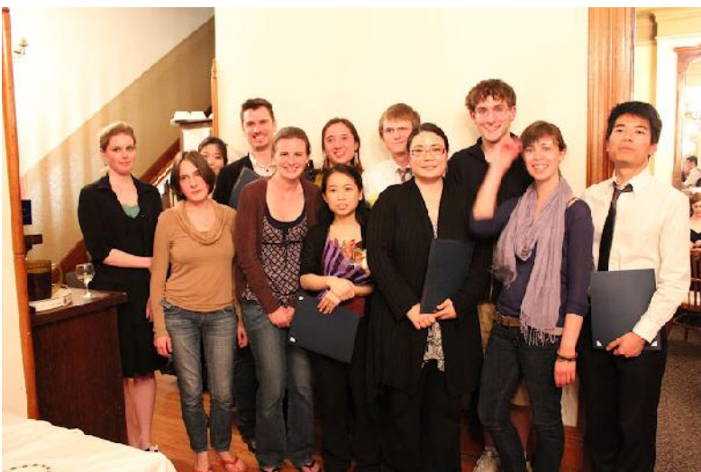
Semi-finalists of the competition