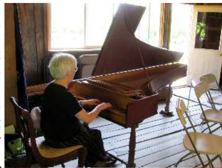
Preparing Brandenburgs in a Barn