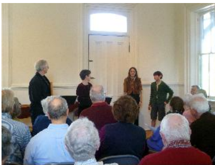
Child actors introduce O Mistress Mine

Pavan for harpsichord and van Eyck's for recorder) and Purcell's Bess of Bedlam . The group has been successful in giving the capacity audience some sense of the context for these arrangements of well-known tunes. Even Bess of Bedlam turned out to have a ballad connection (Tom a Bedlam is mentioned on the title page of King Lear ; Purcell even borrows some of the text of a Broadside Ballad by that name). These songs and dance tunes were like the jazz standards of the 1940s – widely known and enjoyable in various readings.