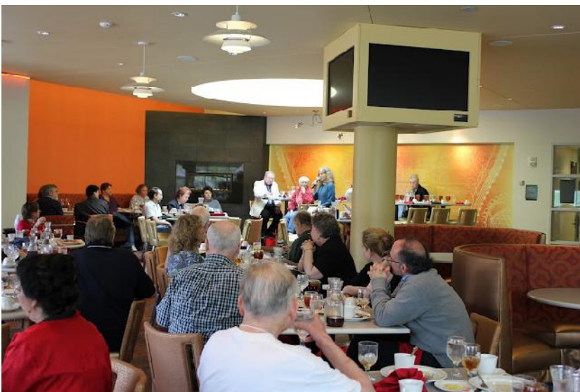
First HKSNA membership meeting