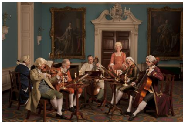
Colonial Williamsburg musicians

Sessions will take place in the Museums of Williamsburg, where the exhibit “Changing Keys: Keyboard Instruments for America 1700-1830” will have just opened; the Williamsburg Lodge and Conference