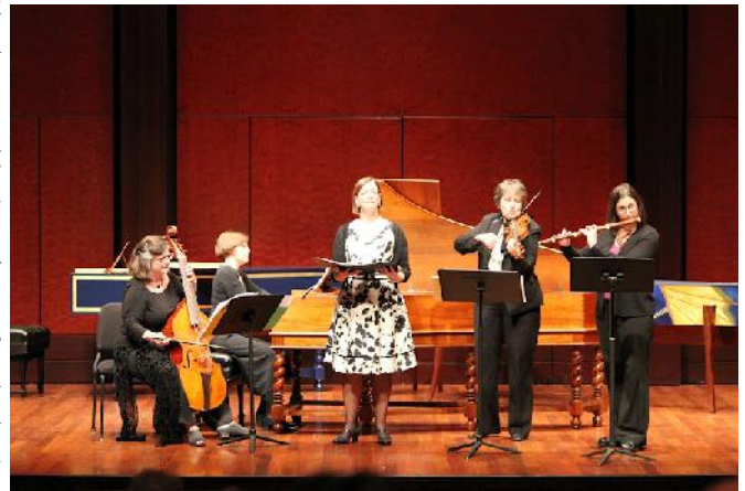
The Cecilia's Circle performing music of Elizabeth-Claude Jacquet de la Guerre