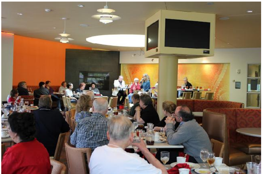
First HKSNA membership meeting