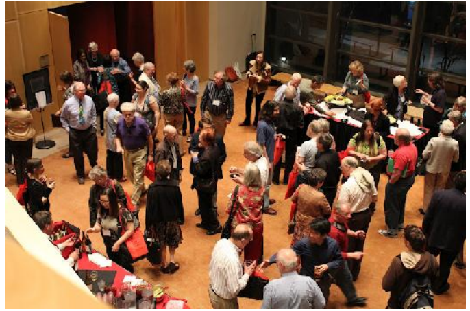
Reception after the opening concert