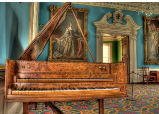
The Palace Ballroom

The call for papers by AMIS can be found at http://www.amis.org/meetings/2013/index.php .